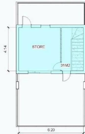
3 H3 2ND FLOOR AREAS 1 : 100